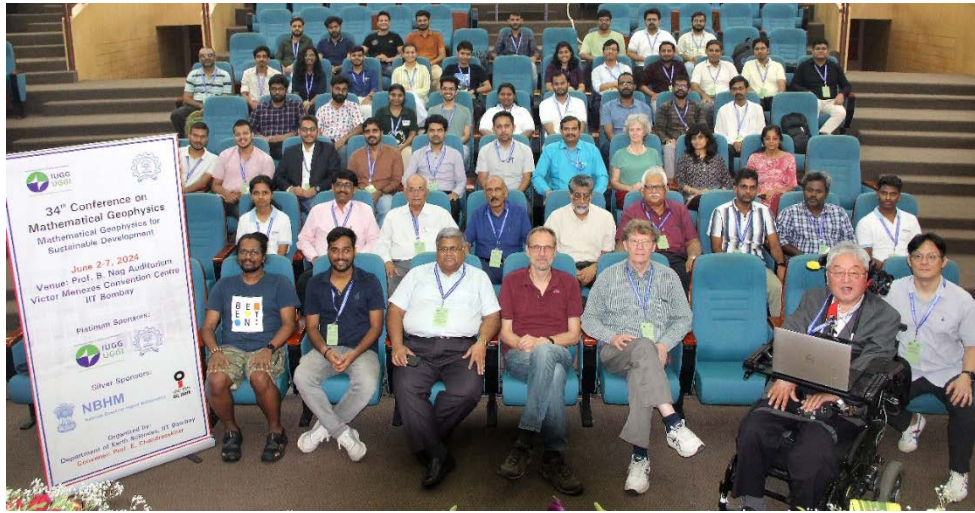
CMG2024 group photo

The conference was preceded by a three-day pre-conference workshop on ‘ Computational Geosciences for Sustainable Development ’ (30 May to 1 June). A variety of topics, such as geo-statistics, geospatial technology, mathematical morphology, nonlinear signal analysis techniques, computational geodynamics, geodesy, and seismic tomography were covered in the workshop. Eminent lecturers from India and abroad delivered lectures in the workshop. About twenty students from various colleges and universities from India attended the workshop. Feedback from the participants of the workshop and the conference was positive and their comments will be considered by the CMG Executive Committee.