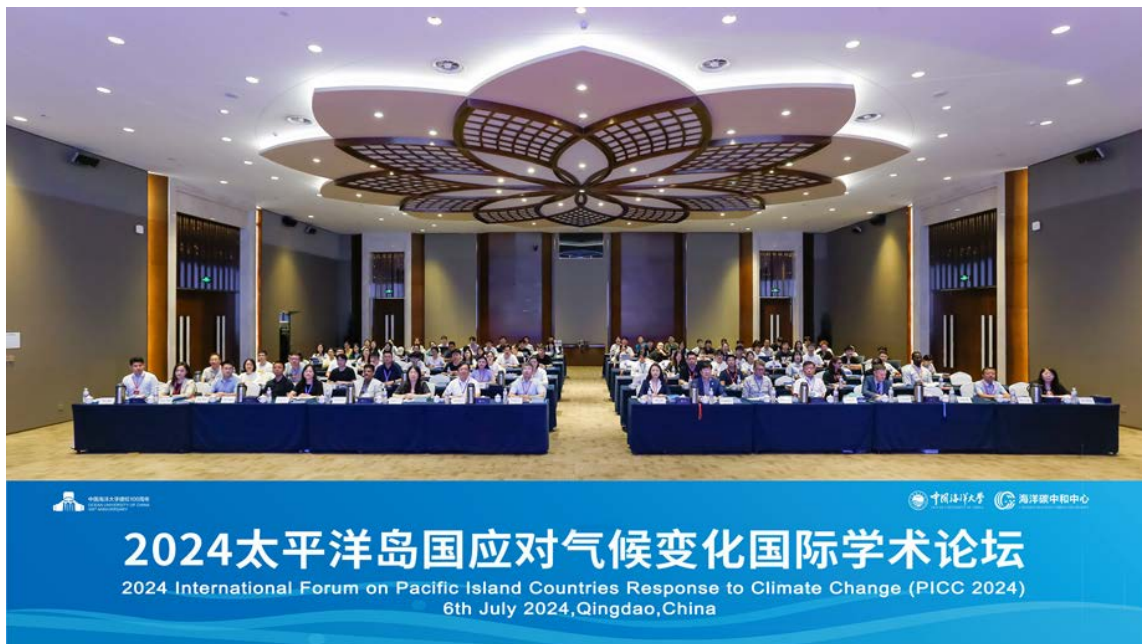
PICC2024 group photo

In conclusion, PICC 2024 was a successful event, thanks to the generous co-sponsorship from International Association of Meteorology and Atmospheric Sciences (IAMAS), IUGG Union Commission on Climatic and Environmental Change (CCEC) and other agencies. The forum called for urgent efforts to accelerate climate action and explore solutions to help PICs better cope with climate change and achieve sustainable development.