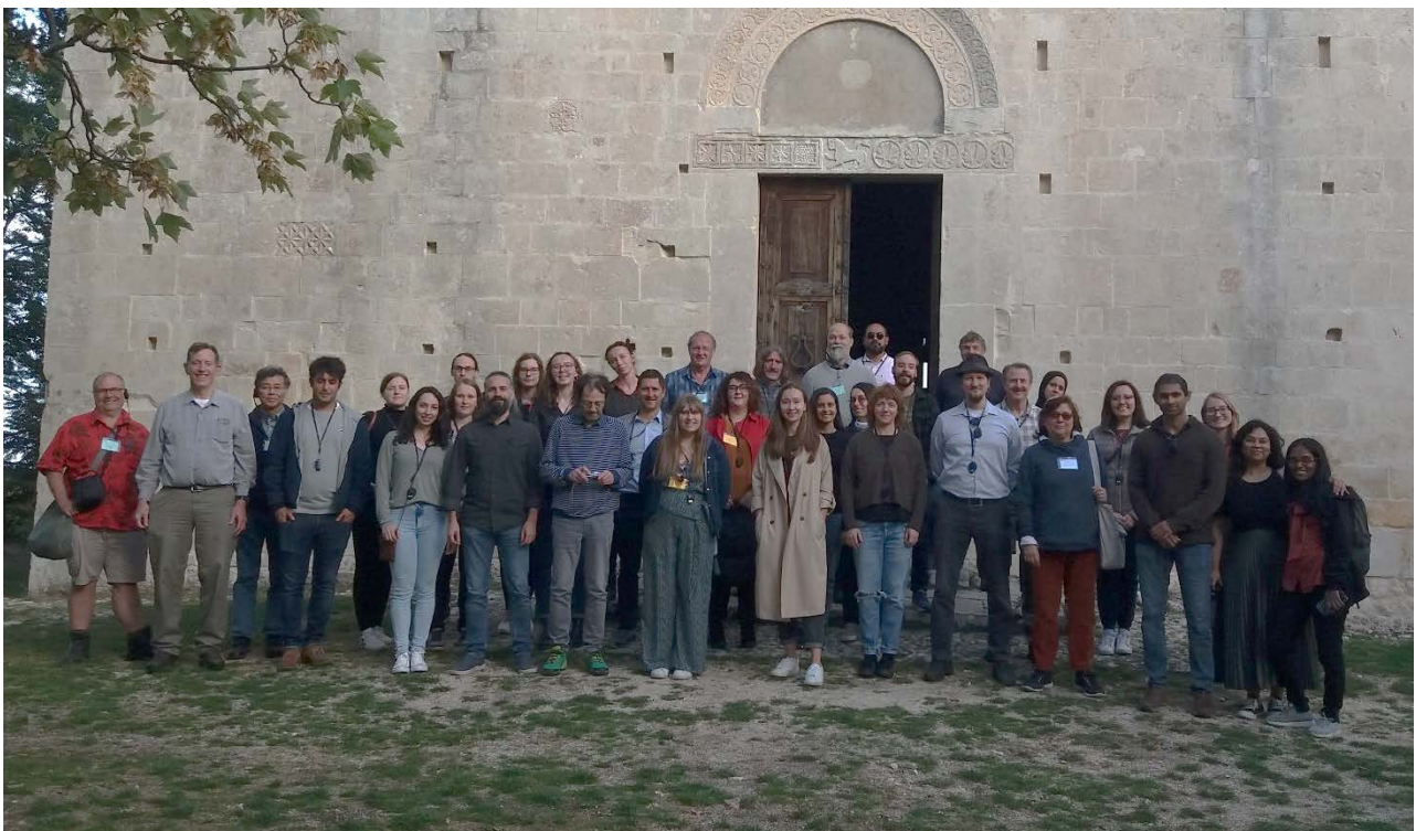
Participants of the course “Radiation Belt Dynamics and Remote Sensing of the Earth's Plasmasphere”

The IUGG financial support was used for the course organisation and for supporting the participation of students from Poland, Brazil, and France at reduced rates.