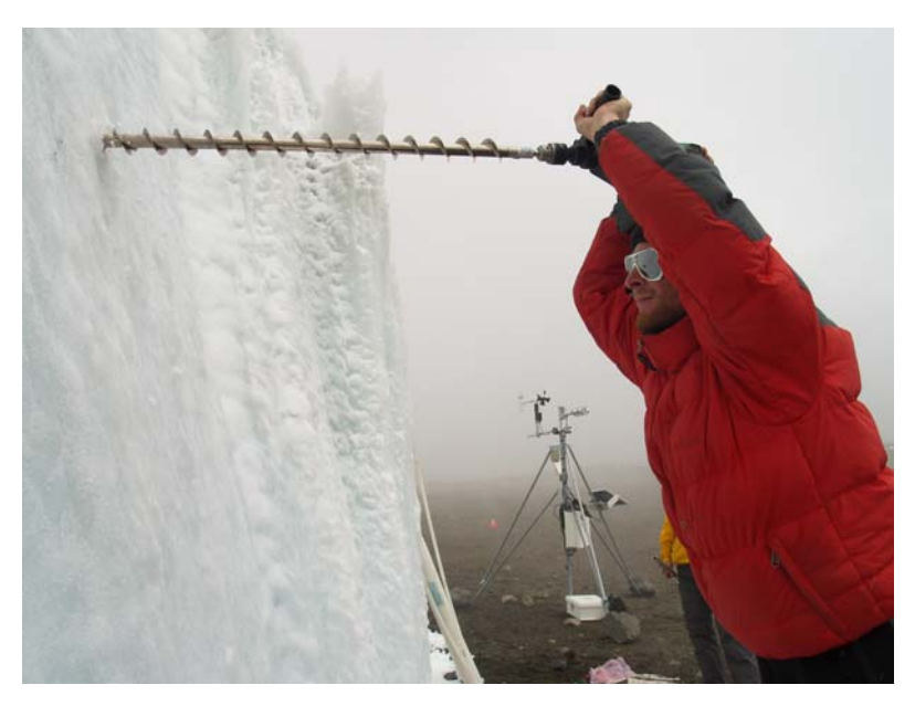
Studies of ice cores help to improve our understanding of climate dynamics and change

All three events will be supported by the IUGG.