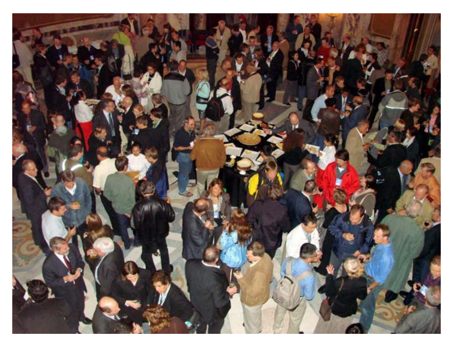
At the 2009 IAG Scientific Assembly