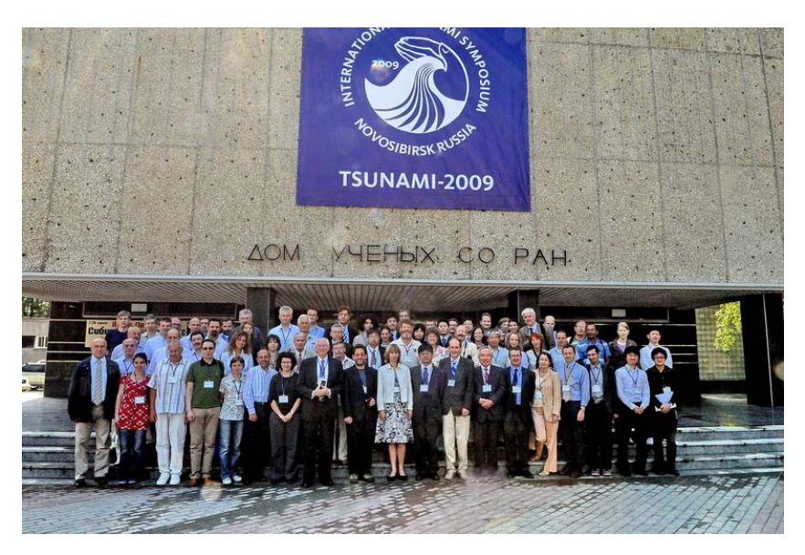
ITS-2009 participants at the entrance to the symposium venue

The scope of the 24<sup>th</sup> Tsunami Symposium covered all the basic aspects of the tsunami phenomenon, be it scientific, technical, social or historical. Basic themes discussed at the symposium were: (1) Historical tsunami observations, catalogs and databases; (2) Tsunami measurements and field observations; (3) Geologic effects and records of tsunamis; (4) Tsunami probability and seismotectonic aspects of tsunami generation; (5) Non-seismic sources of tsunami; (6) Tsunami modelling - generation, propagation and runup; (7) Tsunami impacts on coastlines; (8) Tsunami forecasting and real-time warning; (9) Methods of long-term tsunami risk estimates (coastal tsunami zoning), and (10) Tsunami mitigation and countermeasures.