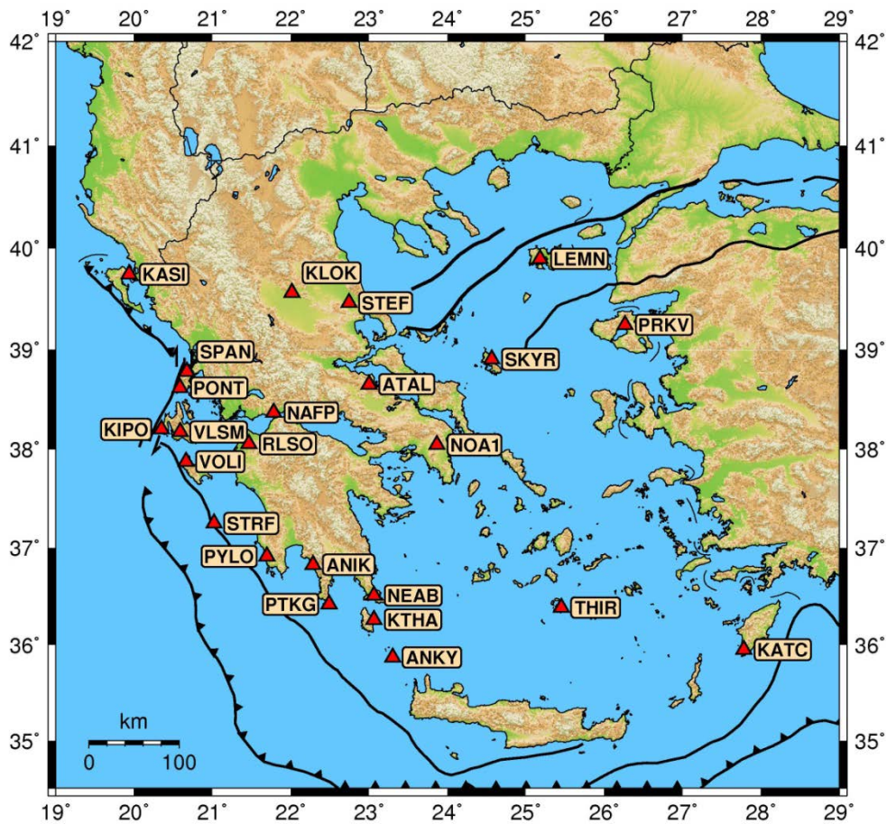
Figure 1. Relief map of Greece with locations of the permanent GNSS stations of NOANET