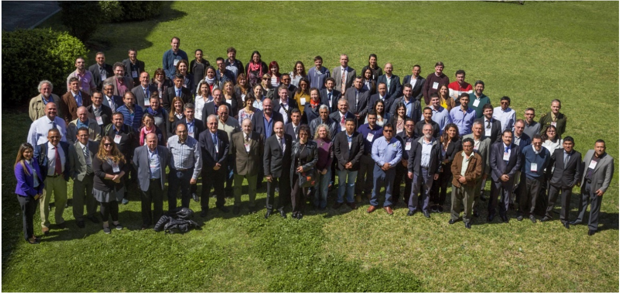
Attendants to the International Workshop for the Implementation of the Global Geodetic Reference Frame (GGRF) in Latin America. Buenos Aires, Argentina, 16-20 September 2019.

In total 130 participants from 20 countries (Argentina, Australia, Bolivia, Brazil, Chile, China, Colombia, Costa Rica, Dominican Republic, France, Germany, Guatemala, Italy, Mexico, Panama, Paraguay, Peru, USA, Uruguay, and Venezuela) attended the workshop. With 52 presentations distributed in eight sessions, it was possible to convene for the first time representatives of (i) politics (United Nations Committee of Experts on Global Geospatial Information Management – UN-GGIM, UN-GGIM Subcommittee on Geodesy, Group on Earth Observations – GEO, ICG-UNOOSA), (ii) international organisations promoting science (IUGG, IAG, IASPEI, International Science Council – ISC, International Federation of Surveyors – FIG, Pan-American Institute of Geography and History – PAIGH), (iii) the highest level of expertise in geodesy worldwide (IAG, IAG Scientific Services, the Global Geodetic Observing System – GGOS), and (iv) regional specialists in geodesy (SIRGAS – Sistema de Referencia Geocéntrico para las Américas , gravity field modelling, geodetic observatories) to identify appropriate strategies to implement the objectives of the UN-GGRF initiative. The topics presented during the five days and the conclusions/recommendations arising from the discussions represent the appropriate start point to advance the establishment of the GGRF in Latin America. Presentations, list of participants and conclusions of the workshop are available here .