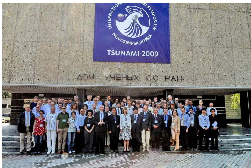
ITS-2009 participants at the entrance to the symposium venue

(coastal tsunami zoning): and 10. Tsunami mitigation and countermeasures. The Symposium's program can be downloaded from: http://tsun.sccc.ru/tsunami2009/program.html .