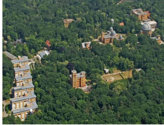
Potsdam, Telegrafenberg (21 st century)

Hundreds of scientists from all over the world are expected to attend the Assembly. The scientific sessions will be held in the 4-star Hotel Dorint Sanssouci in Potsdam City. A session on IAG's history will be followed by a walk-through of the historic buildings at the Telegrafenberg, site of the past Geodetic Institute and of the GFZ today. An exciting program of presentations will highlight the contributions of Modern Geodesy to science and society. For details see http://www.iag2013.org .